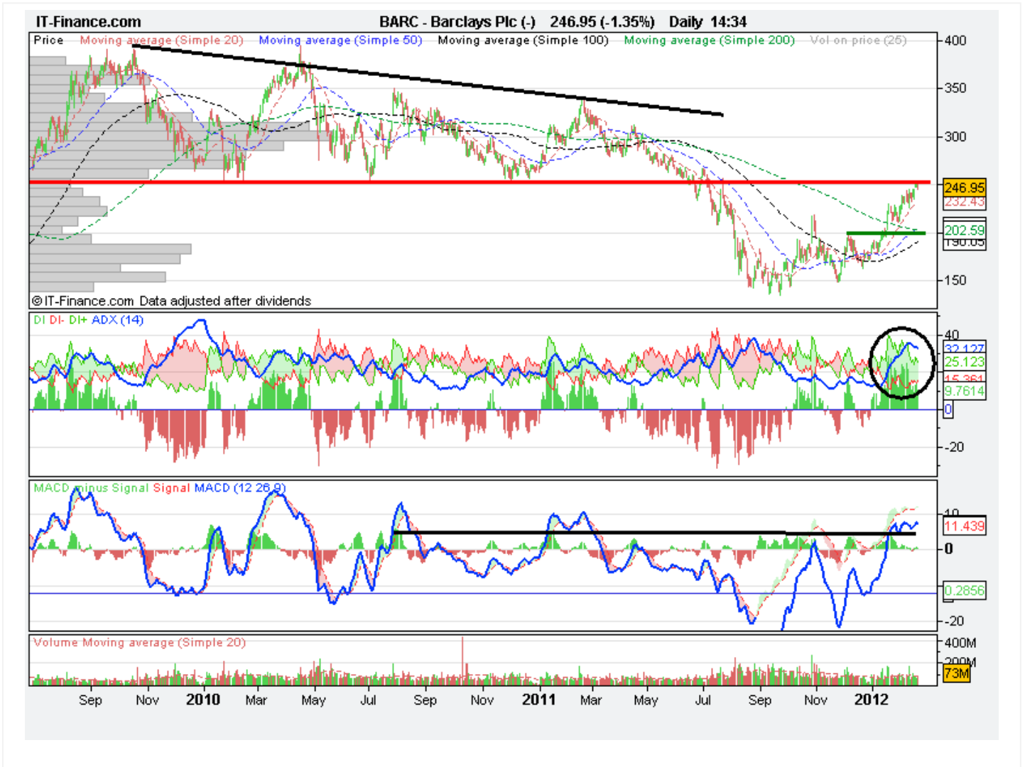
Graph: 2.5-year (daily) - ADX and Directional Indicators, MACD & Volume

Moving averages on price: Green: 200-period, Black: 100-period, Red: 50-period, Red: 20-period